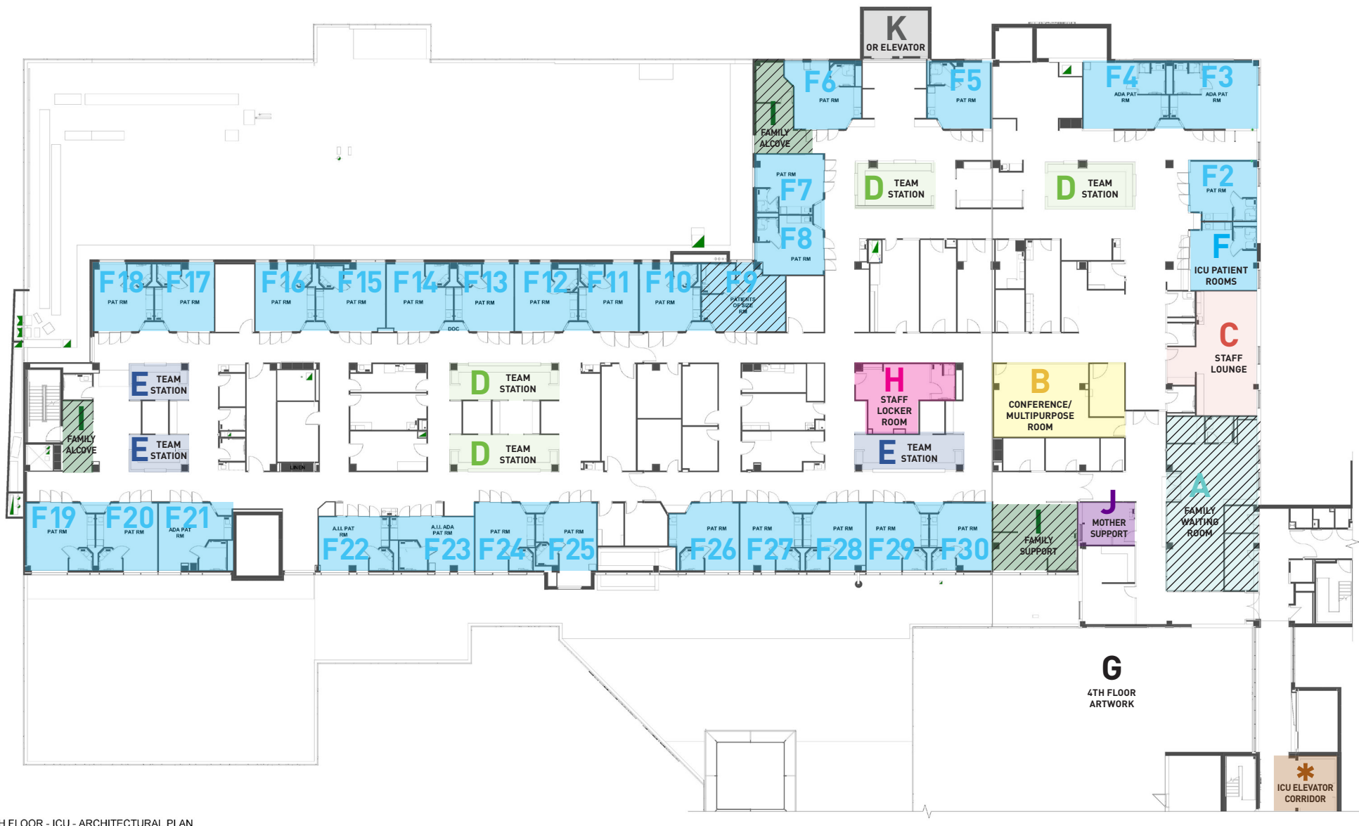
FOURTH FLOOR - ICU - ARCHITECTURAL PLAN